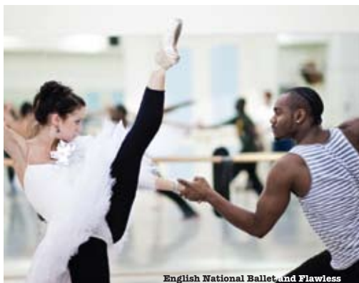
English National Ballet and Flawless